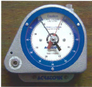
L1 Wall Mounted