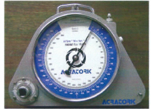
L3 Wall Mounted

Designed for accurate setting and calibration of all types of hand operated Torque screwdrivers and Torque wrenches.